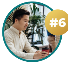
Salary & Job Security