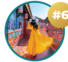
Culture & Welcome