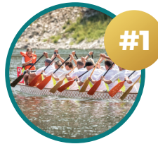
Health & Well-Being