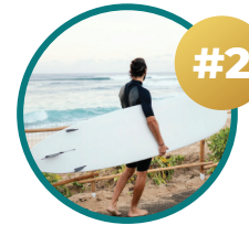
Quality of Life